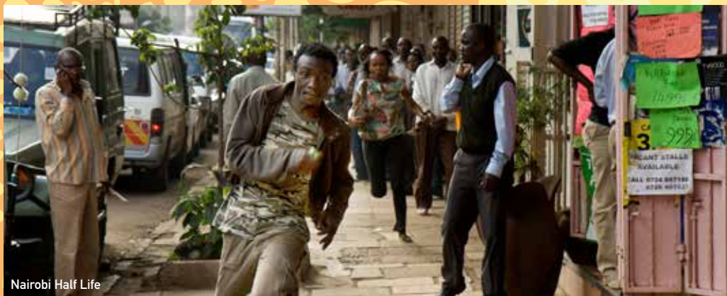
Nairobi Half Life