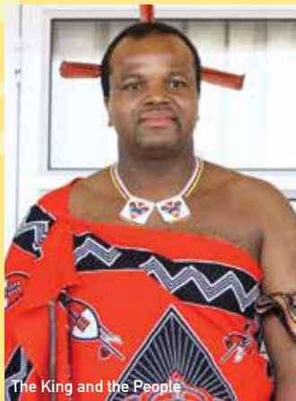
The King and the People