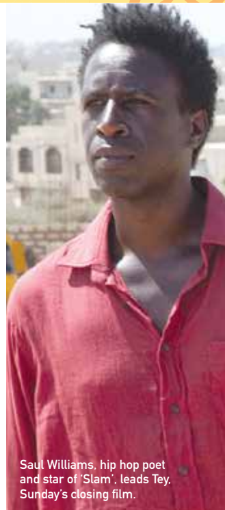
Saul Williams, hip hop poet and star of 'Slam', leads Tey, Sunday's closing film.