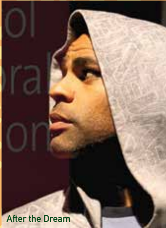
After the Dream