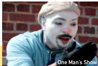
One Man's Show