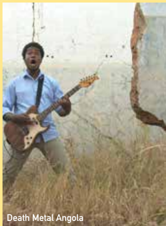
Death Metal Angola

WATCH SOMETHING NECESSARY AND TEY AND ATTEND THE 'WHAT DOES IT TAKE TO BELONG?' SEMINAR FOR £16.00 FULL / £13.00 CONCS.