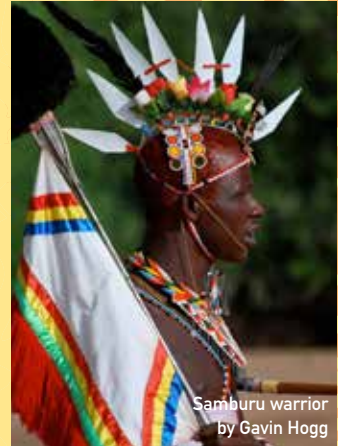
Samburu warrior